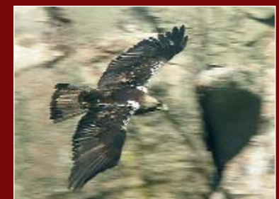
Spanish Imperial Eagle