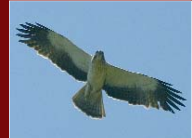
Booted Eagle