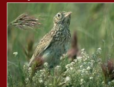
Dupont's Lark

* 7 nights en suite accommodation in rural guest houses