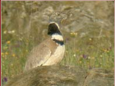
Little Bustard