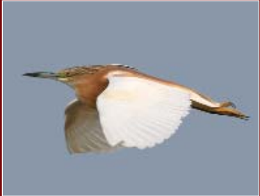
Squacco Heron