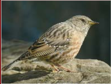
Alpine Accentor