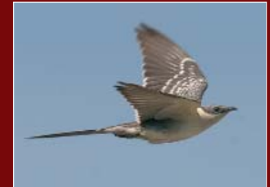
Great Spotted Cuckoo