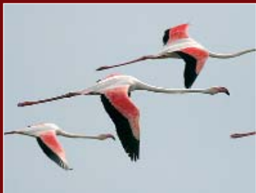
Greater Flamigos

* 7 nights en suite accommodation in rural guest houses