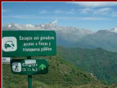
Picos de Europa