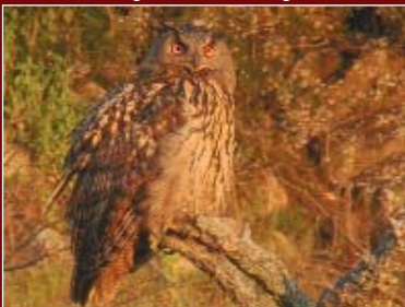
Eurasian Eagle Owl