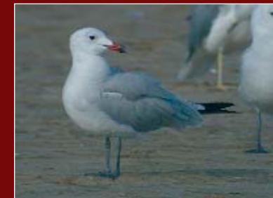
Audouin's Gull

* 7 nights en suite accommodation in a hotel at Zahara de los Atunes