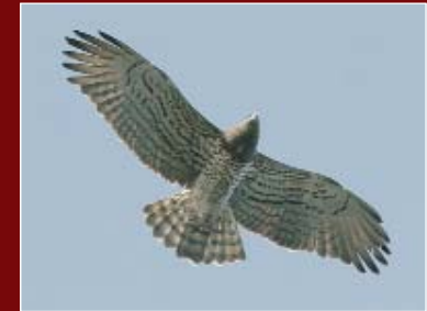
Short-toed Eagle