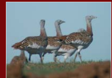
Great Bustards

* 7 nights en suite accommodation in a rural guest house