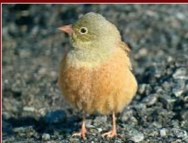
Ortolan Bunting

Raptors, bustards, owls and... bluethroats!